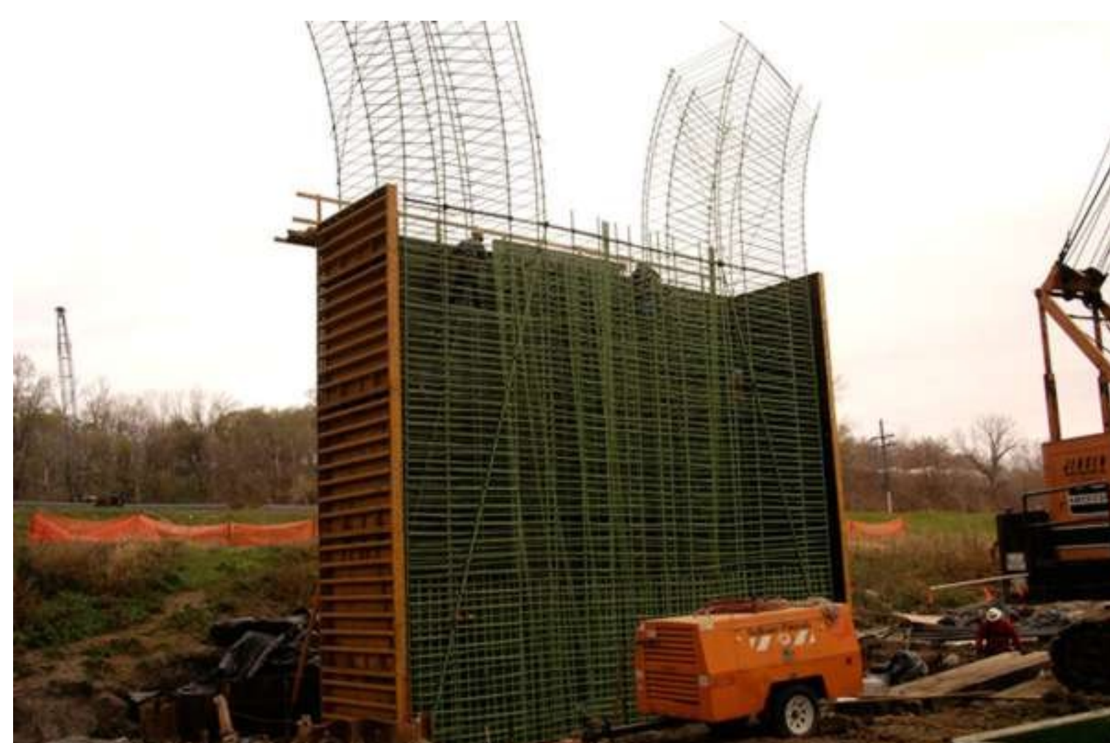
Column from I-80 WB over the Missouri River Bridge

Thermal cracking is the result of large thermal gradients in a massive placement. Thermal gradients induce stress in the placement, which result from the exterior portion of the placement dissipating heat more rapidly than the interior portion of the placement. If the induced stress exceeds the tensile strength of the recently placed concrete, the placement is likely to experience thermal cracking. Historically, keeping the maximum temperature differential below 35°F was found to reduce the likelihood of thermal cracking.